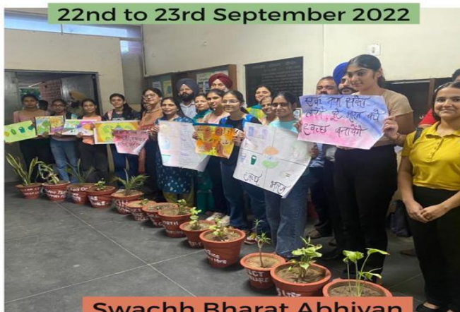
Swachh Bharat Abhiyan under Sewa Pakhwada: Atma Nirbhar Bharat