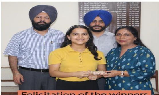
Felicitation of the winners