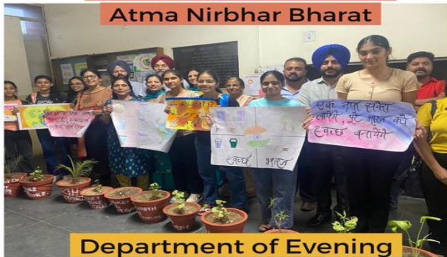
Department of Evening Studies-MDRC