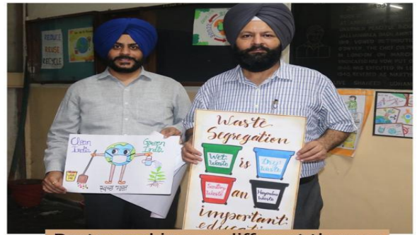
Poster making on different themes of Swachh Bharat Abhiyan