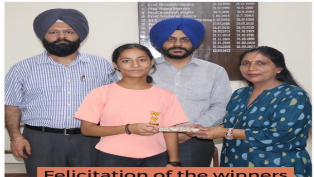
Felicitation of the winners