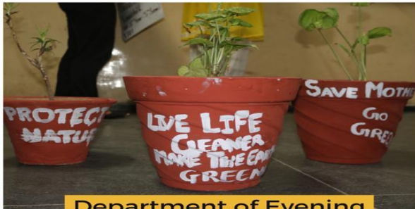
Department of Evening Studies-MDRC