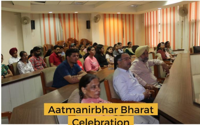
Aatmanirbhar Bharat Celebration