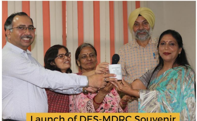
Launch of DES-MDRC Souvenir