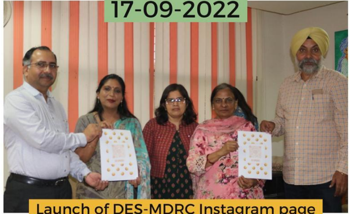
Launch of DES-MDRC Instagram page